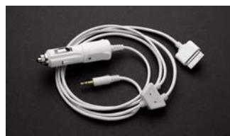
AUDIO CABLE AND CAR CHARGER FOR IPOD ® ^^ Suits all dockable iPods ® Available on selected models where AUX-in option is part of audio unit. Suits iPod ® models that have a dock connector