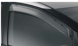
FRONT WEATHERSHIELDS Available on all models