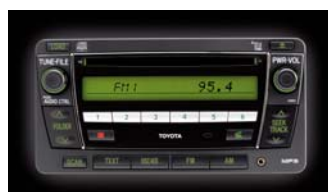
6 DISC IN-DASH MP3 COMPATIBLE CD CHANGER AND RADIO WITH BLUETOOTH ™ COMMUNICATIONS AND AUDIO INPUT Available on GLI

^ Towbar capacity subject to regulatory requirements, towbar design, vehicle design and towing equipment limitations.