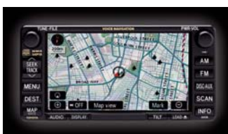
SATELLITE NAVIGATION ### AUDIO SYSTEM INCLUDING 4 DISC IN-DASH MP3 COMPATIBLE CD CHANGER WITH BLUETOOTH ™ COMMUNICATIONS AND (OPTIONAL) AUDIO INPUT Available on GLI and GLX models