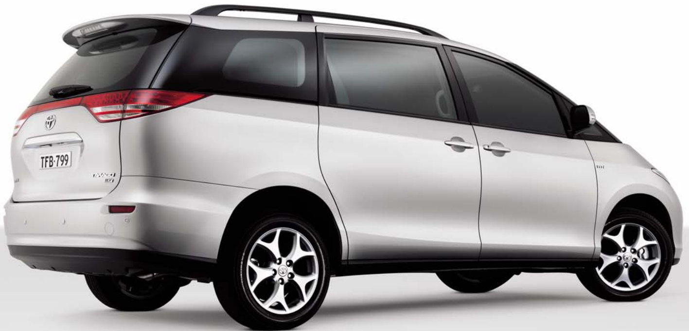
4 cylinder GLX model shown.