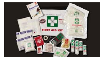
FAMILY FIRST AID KIT Available on all models