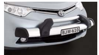
ALLOY NUDGE BAR # Available on all models