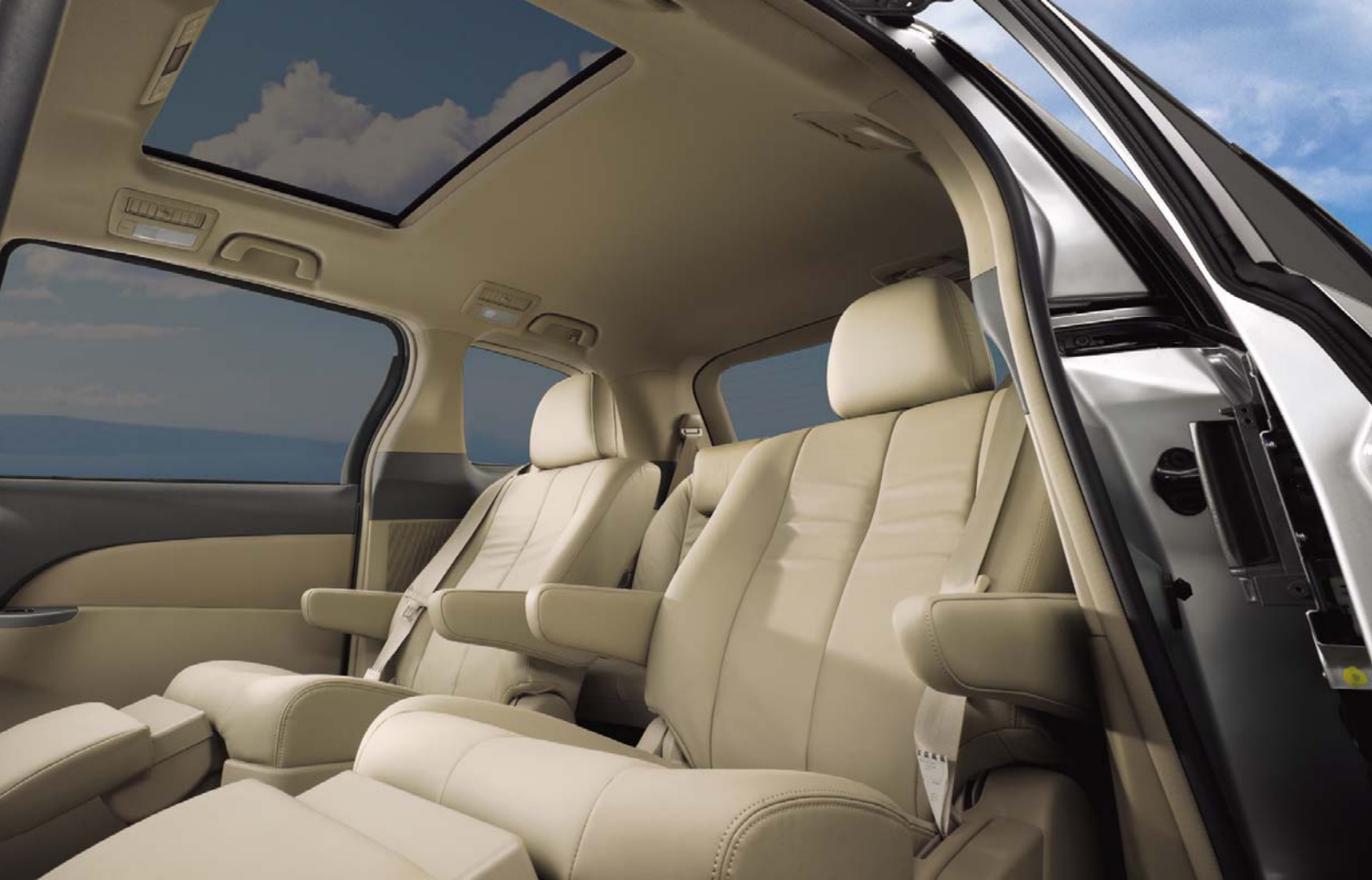
Ultima model shown.