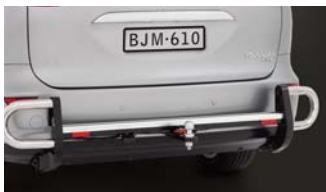
TOWBAR WITH REAR STEP & PROTECTOR, TOWBALL & TRAILER WIRING HARNESS ^ Available on all models (sold separately)

THESE ARE JUST SOME OF THE ACCESSORIES AVAILABLE FOR YOUR TARAGO. FOR A COMPLETE LIST AND FURTHER DETAILS, PLEASE SEE YOUR TOYOTA DEALER OR REFER TO OUR WEBSITE.