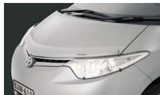
BONNET PROTECTOR & HEADLAMP COVERS Available on all models (sold separately)