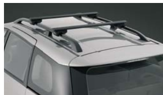
AERO ROOF RACKS (ROOF RAIL TYPE) Available on all GLX models