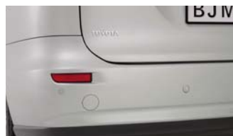
PARKASSIST-REVERSE PARKING SENSOR (4-HEAD KIT) SHOWN ON GLI ** Available on all GLI models