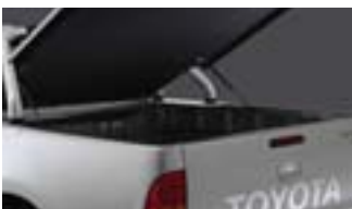
HARD TONNEAU COVER