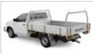
ALLOY TRAY BODY WITH OPTIONAL REAR RACK AND ALLOY WINDOW PROTECTOR FITTED

THESE ARE JUST SOME OF THE ACCESSORIES AVAILABLE FOR YOUR HILUX. FOR A COMPLETE LIST AND FURTHER DETAILS, PLEASE SEE YOUR TOYOTA DEALER OR REFER TO OUR WEBSITE.