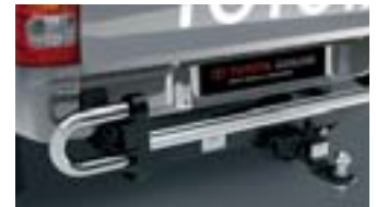
TOWBAR WITH REAR STEP (2250kg Braked) TOWBALL AND TRAILER WIRING HARNESS (SOLD SEPARATELY)