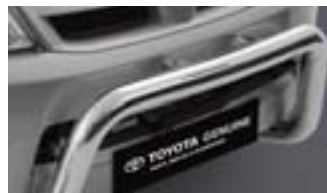
ALLOY NUDGE BAR – AIRBAG COMPATIBLE