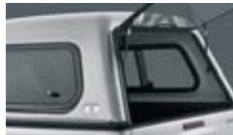
CANOPY (HIGH ROOF)