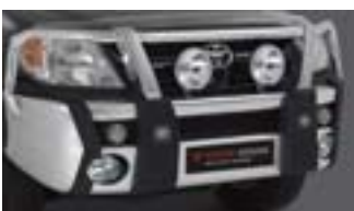
4X4 FORGE ALLOY BULL BAR – WITH OPTIONAL DRIVING LIGHTS (SOLD SEPARATELY)