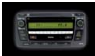
6 DISC IN-DASH MP3 COMPATIBLE CD CHANGER AND RADIO WITH BLUETOOTH™ HANDSFREE COMMUNICATIONS AND AUDIO INPUT