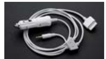
AUDIO CABLE AND CAR CHARGER FOR IPOD®#