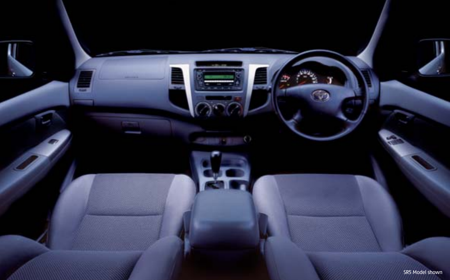
SR5 Model shown