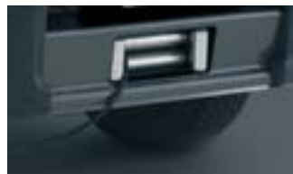
SUPERWINCH (9000lb CAPACITY)