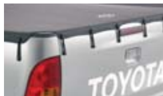
SOFT TONNEAU COVER