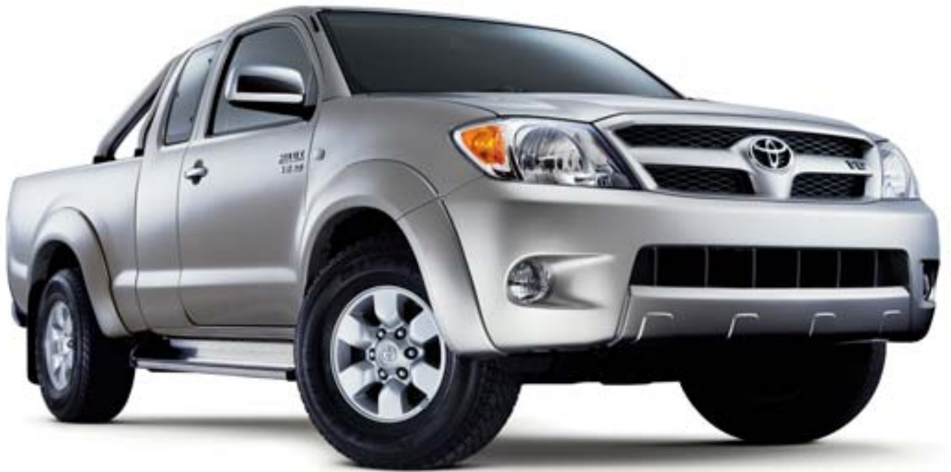
4x4 Xtra Cab SR5 model shown