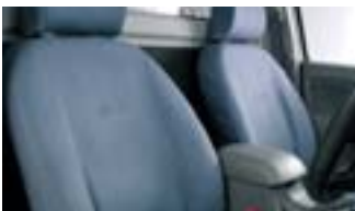
CANVAS SEAT COVERS