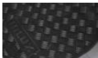
ALL WEATHER RUBBER FLOOR MATS FRONT AND REAR AVAILABLE (SOLD SEPARATELY)