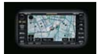
SATELLITE NAVIGATION™ AUDIO SYSTEM INCLUDING 4 DISC IN-DASH MP3 COMPATIBLE CD CHANGER WITH BLUETOOTH™ COMMUNICATIONS