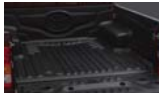
UTE LINER AND TAILGATE LINER